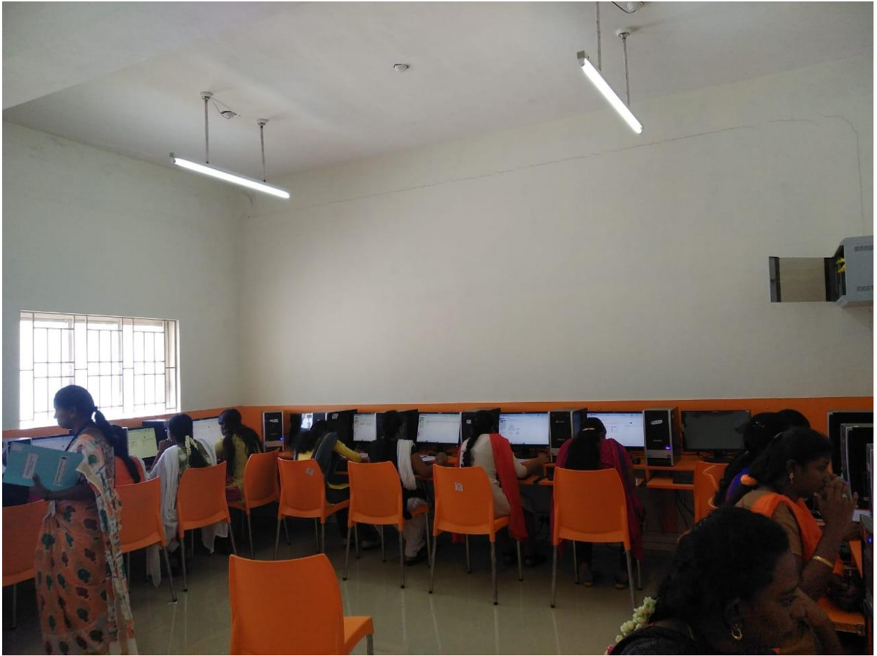
Online Test for IT PT Stream Date: 28.02.2020 Venue: MTWU, Kodaikanal