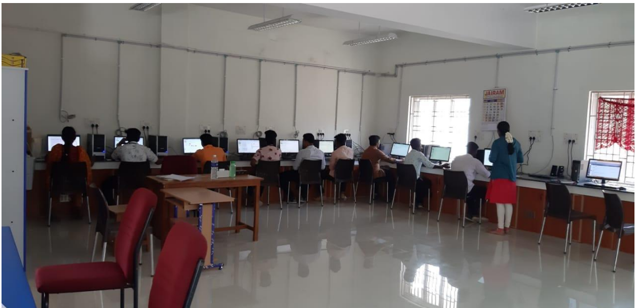
Online Test for CIS GT Stream Date: 06.03.2020 Venue: MTWU, Kodaikanal